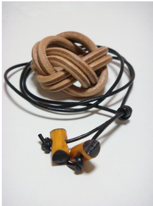
The Getting started woggle and the Wood badge

It is accepted as best practice not to be alone at any time with a member, two adults at all times.