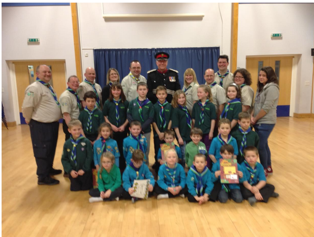
Awards night: with the Deputy Lord Lieutenant for Cambridgeshire and the District Commissioner.

Thank you once again, and welcome aboard!