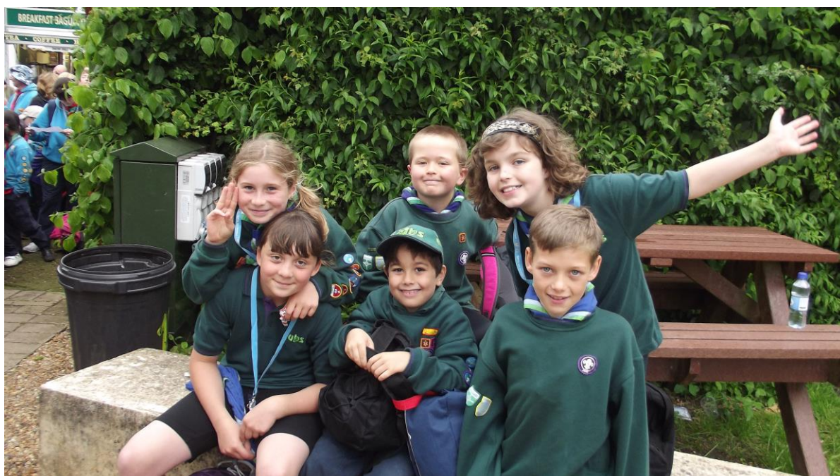
Our Cubs at the Gilwell Funday