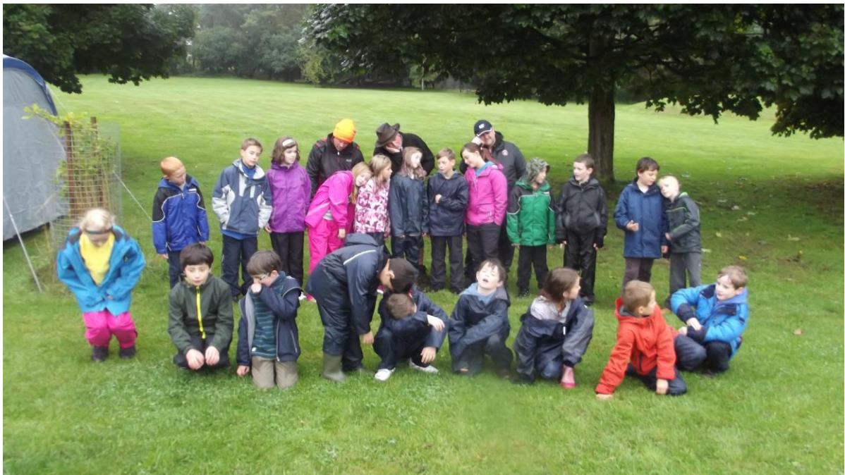
District Cub Camp