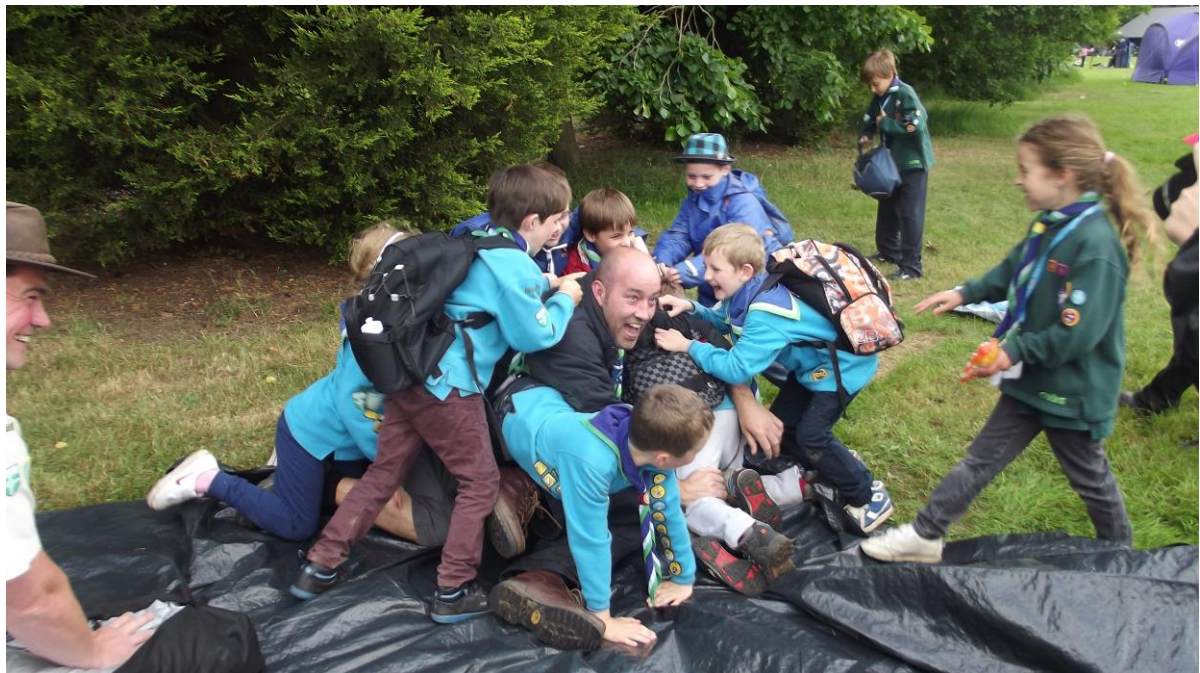
Our Beavers at the Gilwell Funday